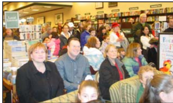
The Mirror Lake Middle School fundraising event at Barnes and Noble attracted many supporters.

Through the efforts of school business partner Alaska